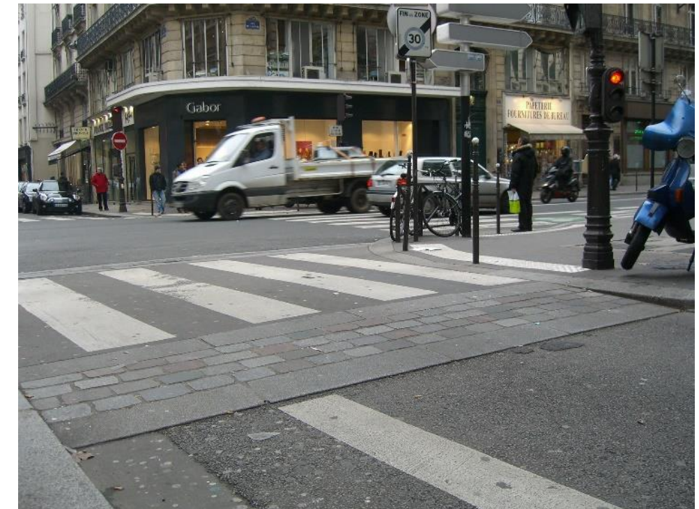
A raised crossing at sidewalk-level across a low-speed, low-volume street.

B-3d: Provide marked crosswalks and Accessible Pedestrian Signals (APS) at all legs of an intersection where there are connecting sidewalks or comfortable streets.